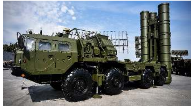
Figure 1 S-400 According to Siemon Wezeman Senior Researcher of SIPRI the S-400 "is among the most advanced air defence systems available

Maybe the Devil is in the detail and that it comes from Turkey. During the attempted “coup” against him, President Erdoğan realized an uncomfortable fact;