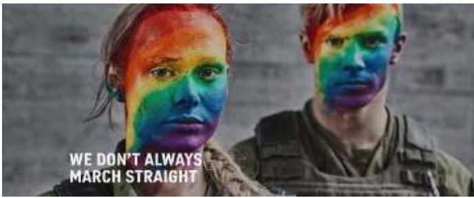
Figure 10 Swedish Armed Forces

Russia has no other project that the return to Russia at the top of the world's powers, as a reliable ally and a positive game changer for its clients. The European Union has for only concern that the world should turn out to be a planet-wide Sweden. And the United States of America seems to have no other concern than to fight a war against themselves, globalists against nationalists and conservatives against progressives. Can we really talk here about the way to make the USA and Europe safe again?