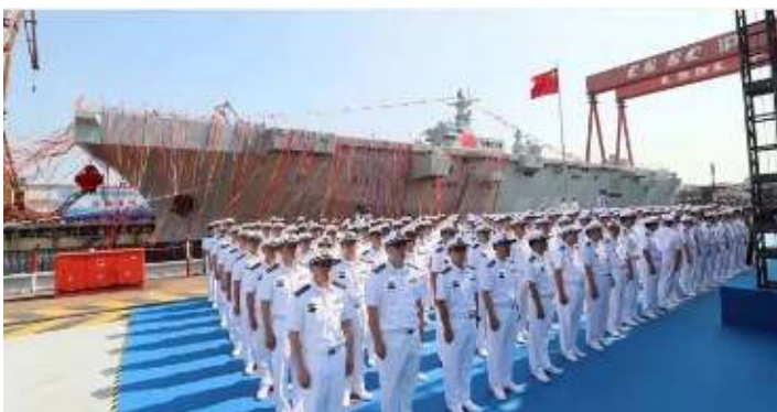
Figure 5 The 'Type 075' amphibious assault ship would allow the People's Liberation Army to carry about 30 helicopters and transport hundreds of troops

American ships and other systems are just simply contemplating to the Russian ability to paralyse radio communication like the northern lights does. During a close encounter with Russian fighters or Russian fishing boats, they were deaf and mute. How does it work in a real war confrontation is yet to be known—and feared. Some voices still remind what happened when US Navy vessels collided in the China Sea (the admiral commanding the 6 th fleet resigned soon after) . Some other voices remind the way