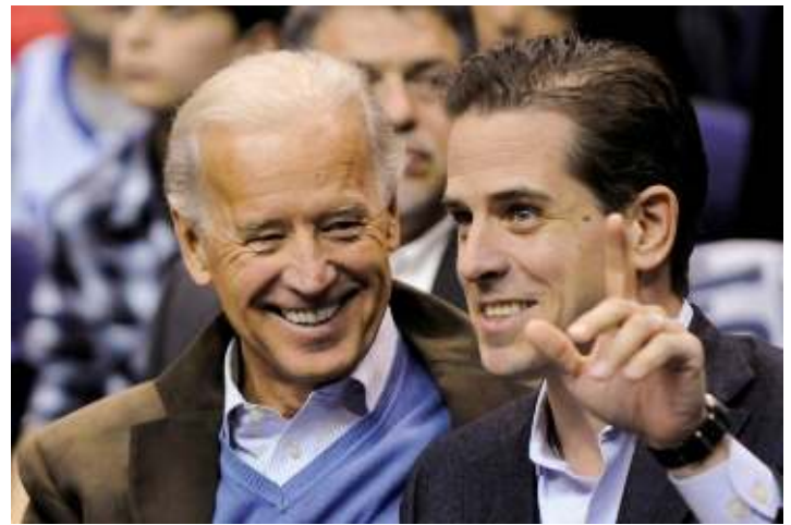
Figure 9 Joe & Hunter Biden

Korea is not the only one to ask the question—and to give the only relevant answer, the same Israel gave fifty years ago, with some French friends to help. As