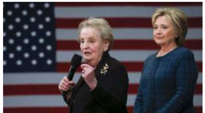
Figure 8 Madeleine Albright en compagnie de Hillary Clinton en février 2016.

The loss of so many experts on the fields of comprehensive intelligence is another severe blow to the US defense system, and our own safety. The conventional and non-conventional intelligence capital seems to have vanished at fast pace the last twenty years. Where are James Baker boys, Kissinger old students, and the unending talks with M6 or French intelligence community members? Where are "kremlinologues" who knew the Soviet history better than their Russian counterparts? Where are those American experts who knew not only the gap between Shiites and Sunnis, but were able to analyze different Sunni communities, who met the Hezbollah leaders and the Alawites as well, and respect their logic and values?