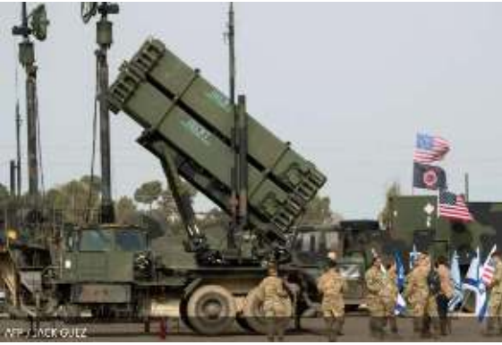
Figure 6 US army officers stand in front a US Patriot missile defence system during a joint Israeli-US military exercise earlier this month

universities. To this, we can add the growing inability to understand the rest