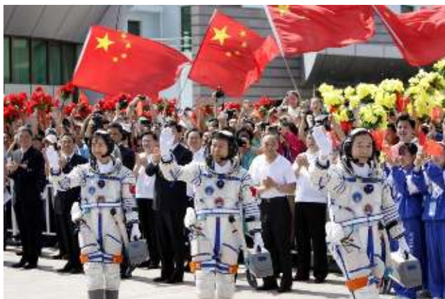
Figure 3 Chinese astronauts Jing Haipeng, Liu Wang (C) and Liu Yang (L), China's first female astronaut, wave during a departure ceremony on June 16, 2012. China sent its first woman into outer space, prompting a surge of national pride as the rising power takes

They have attained 80% of their targets, with an average precision better than 2 meters. The fact is appealing for a complete renewal of protecting targets and life systems—even in France. They did not need Special Forces on the surface to illuminate the target, and they do not need costly engines, missiles, detection and guiding systems to find, fix and destroy their targets. What do you think of near nuclear centrals, near gas and refinery terminals, in Israel or southern Europe as well? The perspective of thousands of armed drones used to paralyse the opponent's defense. One of the most disturbing perspectives that Pentagon's gurus have to face is clear and simple; how can an intelligent but very cheap device do harm or even destroy the most powerful and expensive systems on earth?