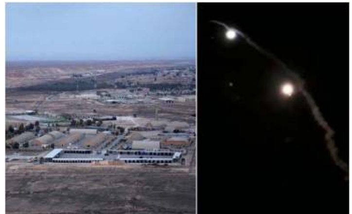
Figure 7 The attack on the Ain al-Asad airbase came after pro-Teheran factions in Iraq had vowed to join forces to “respond” to an American drone strike.

cause are not alone. The hundreds of Boeing 737 S grounded, the call from different crews (from American Airline, for instance) not to fly them give a harsh view of the current extent of a growing problem. The results of American military strikes in Syria were far away from being bright, and this is also the case with the performance of hundreds billion missile shields called “Patriot” in Saudi Arabia or even in Israel. When Iran launches its retaliation attack after the killing of Gal Souleymani, none of the 16 Iranian missiles were stopped by the US anti-missile system from the Ayn-al-Assad base, in South Irak!